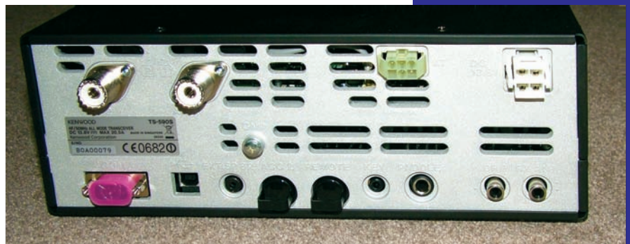
The rear panel of the transceiver showing the h.f. and 50MHz antenna inputs.

www.kenwood-electronics.co.uk/products/comms