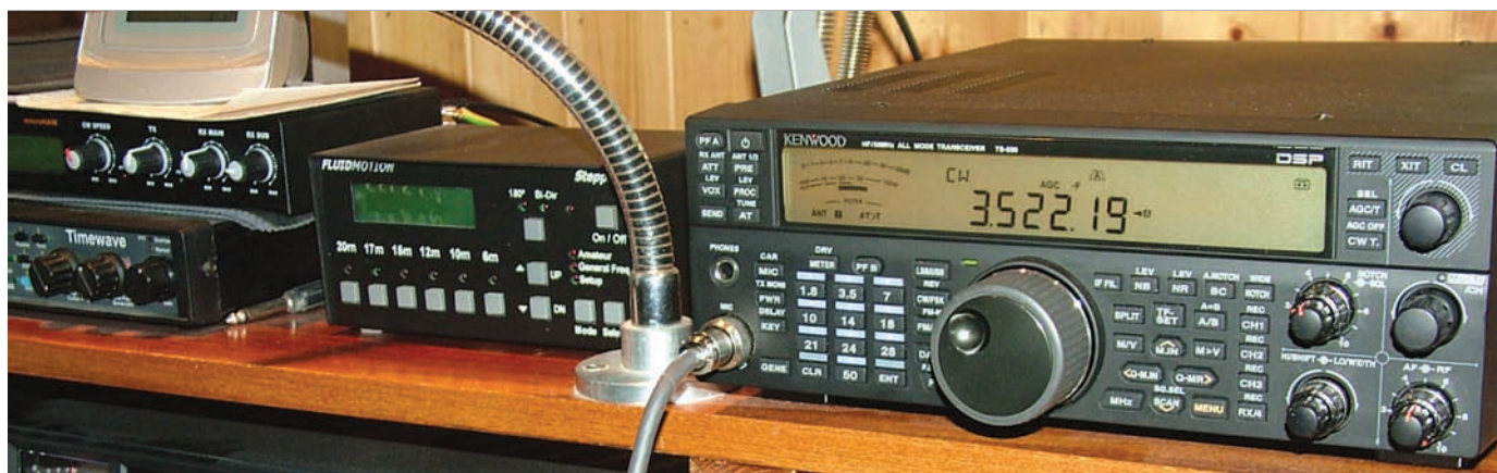
The TS-590's high contrast main display.

I also worked a number of USA and Canadian stations, one in ZF1, Grand Cayman Island, ZL50VK in New Zealand and an OY and a UA9 on 1.8MHz. The Top Band QSOs were on c.w. using a 1.8MHz inverted V dipole with the apex at 90ft on my tower.