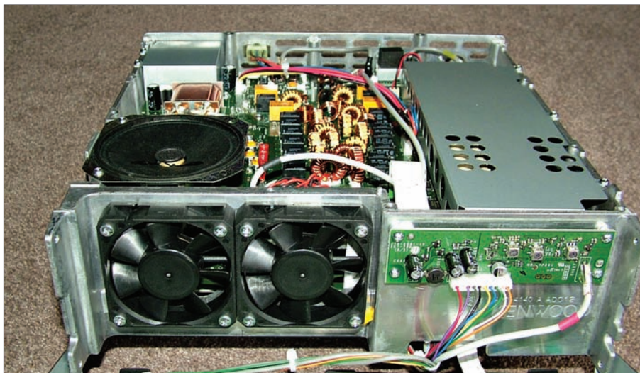
A pair of slow running 60mm square fans assist the cooling on the TS-590S.

Two noise blankers, or 'reduction functions' in modern parlance, are used to reduce interference and a nearby electric fence was certainly quietened down by these. Electric fence are one of